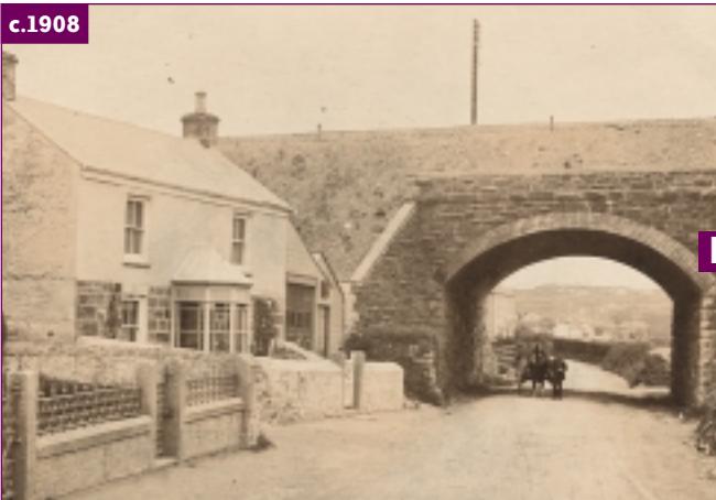
John Passmore Edwards